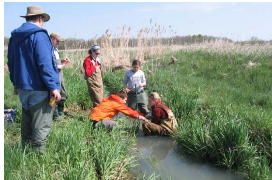
Figure 2. Researchers from The Ohio State University and the University of Notre Dame collecting data in a two-stage ditch.

Natural adjustments in unmaintained systems often establish fluvial channels, henceforth called inset channels, within the large modified or constructed ditch (Jayakaran and Ward, 2007; Powell et al., 2007). These inset channels have small stable floodplains, henceforth called benches that form by vertical accretions of deposited sediment that then vegetate with grasses. The formation of benches in a ditch is associated with an overwide geometry at the bottom of the ditch, sediment supply, cohesive soils that vegetate rapidly, and sufficient stream power to transport sediment through the system without excessive scour of the bed and banks.