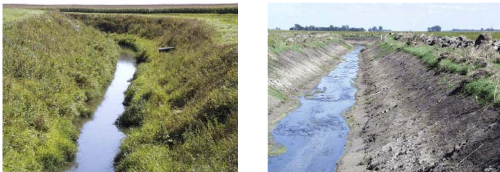
Figure 1. A ditch in Minnesota with benches (left) and after maintenance to remove deposited sediment and benches (right).

In the Midwest Region, headwater systems usually contain more than two-thirds of the channel miles, have geometries that are small enough to be modified in a cost effective manner, and provide the most opportunity for water quality improvement. Agricultural channels are often deepened and straightened to facilitate the flow of water from subsurface drainage outlets and maximize conveyance capacity. The resulting modified channel geometries are incised trapezoidal channels with little or no connection to an active floodplain. Often, channel maintenance is necessary to remove woody vegetation and deposited sediment, stabilize bank slopes, and to address toe scour problems (Fausey et al., 1982). These routine maintenance activities are costly, disrupt the existing ecology, and adversely impact water quality. Figure 1 shows a ditch in Minnesota before (left) and after (right) a maintenance activity. Small stable fluvial benches at the bottom of the channel have been removed and runoff is already transporting high sediment loads.